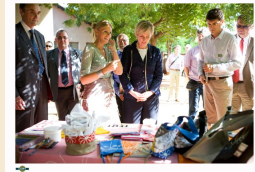
Princess Astrid and Archduke Lorenz of Austria-Este admire Mabinti Center products at CCBRT

commented on the high quality of the services available at the hospital. During her tour of the hospital, the princess expressed particular interest in our fistula work.