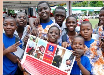
Members of the crowd with one of the posters produced.

Whilst CCBRT serves the needs of hundreds of people with disabilities each and every day through consultations, surgeries and rehabilitation sessions, an increasingly important aspect of our work is to raise awareness about disability issues throughout Tanzania and put disability issues on the government agenda. The global observance of International Day of Persons with Disabilities on 3 rd December was an opportunity to do this. CCBRT was more involved in planning activities in Tanzania to mark the