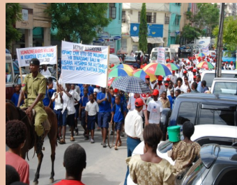
A march through Dar es Salaam to mark International Day of Persons with Disabilities.