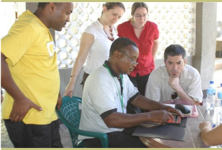
Participants from Light for the World undergoing training at CCBRT.