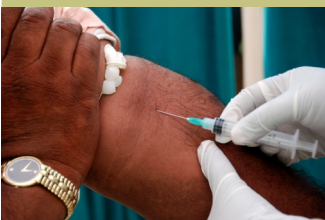
20 out of the 40 clients who came for voluntary HIV/AIDS tests during International Day of Persons with Disabilities had impairments.

and abroad, CCBRT linked up the Tanzania Albino Society with a Belgian photojournalist. It is hoped that this tie-up could lead to a mobile exhibition on people with albinism and result in a book about the condition to be distributed in schools throughout Tanzania. Many people with albinism attended the International Day of Persons with Disabilities and heard the Minister of Health and Social Welfare promise that the perpetrators of the crimes would be brought to justice.